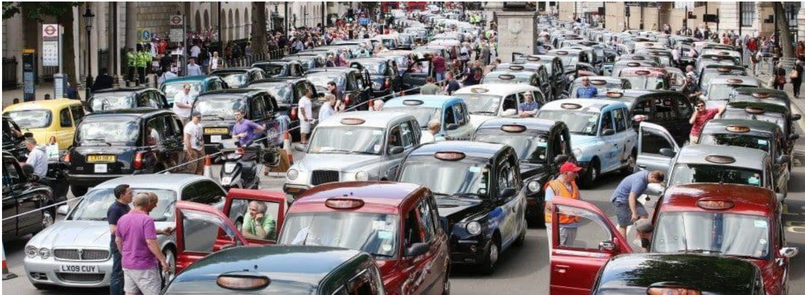
Taxis blockade Whitehall in London, protesting the introduction of Uber in Britain.

Mayor of London said, "I want London to be at the forefront of innovation and new technology and to be a natural home for exciting new companies that help Londoners by providing a better and more affordable service, however, all companies in London must play by the rules and adhere to the high standards we expect-particularly when it comes to the safety of customers.